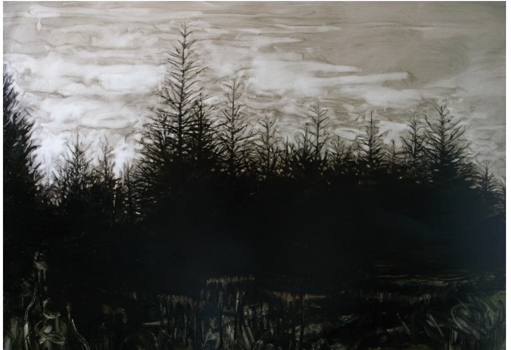
right: Winter Forestry II Oil on Board, 62 x 89cm