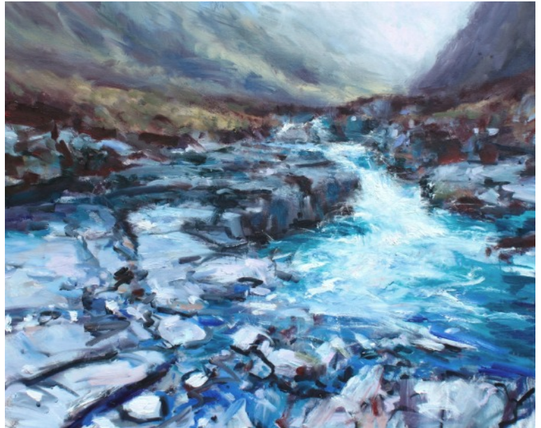
right: River Coe, Glen Coe Oil on Canvas, 79 x 100cm