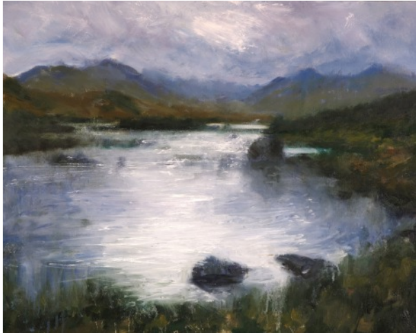
left: Rannoch Moor Oil on Canvas, 60 x 75cm