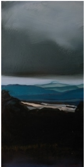
left: West Lomond Oil on Board, 41 x 20cm