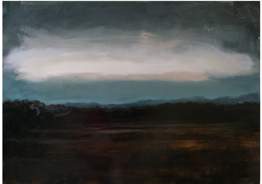
left: Forestry Study I Oil on Board, 25 x 14cm