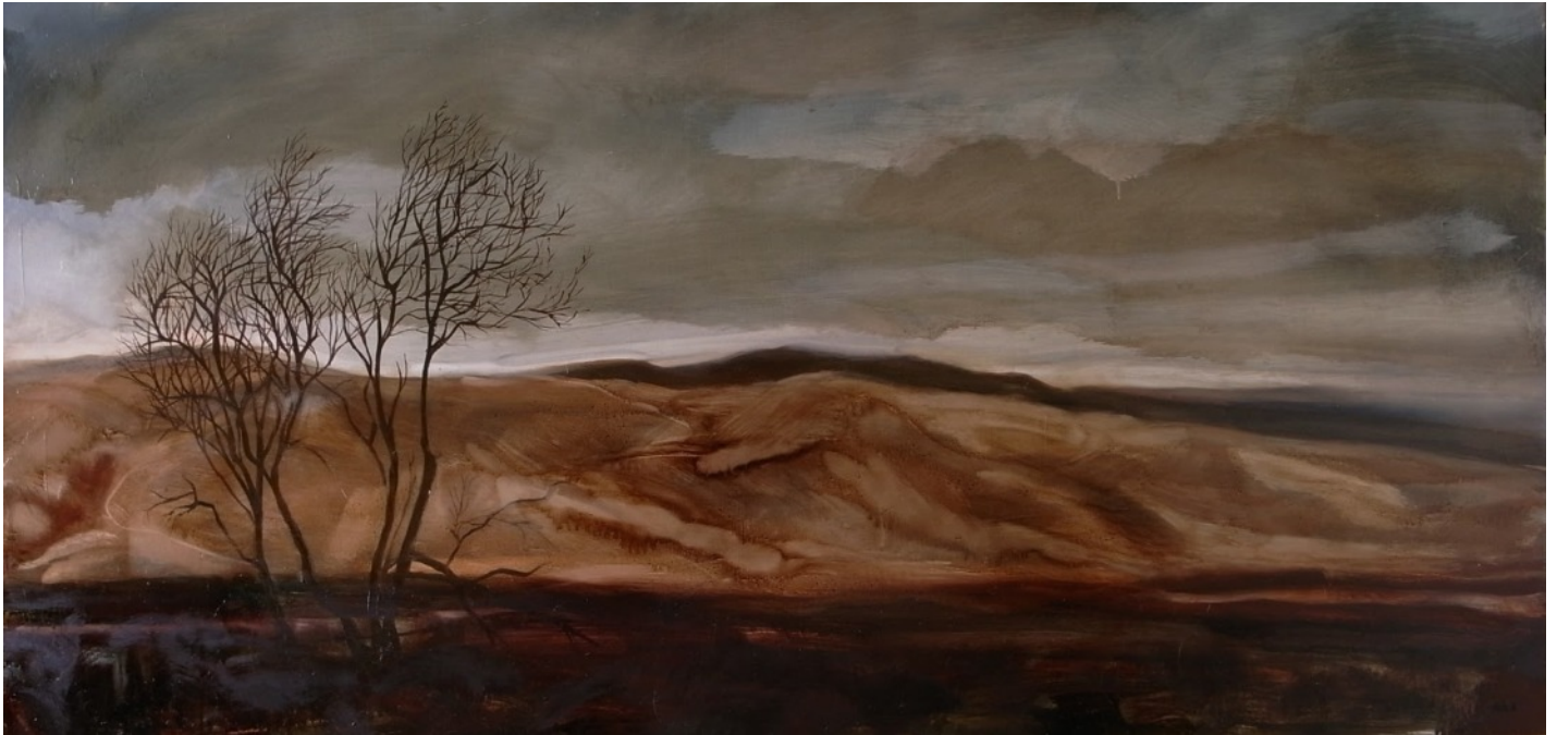
February Oil on Board, 61 x 122cm